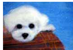
"Just One Look"

Note cards are on beautiful white paper stock, approximately 5' x 7" with a 4" x 6" print of the watercolor painting. Each packet includes an assortment of cards. (Can also be framed)