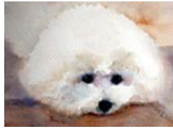
"She's Got The Look"

Watercolor print is 8 x 10" and matted to 11 x 14"