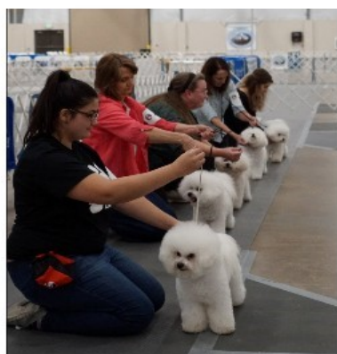
Best of Breed competition