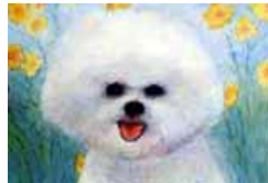
"It's A Chelsea Morning"

Note cards are on heavyweight textured matte white card stock, approximately 4 1/4" x 5 1/2" with the bichons watercolor painting on the face of the card. Each packet includes an assortment of cards.