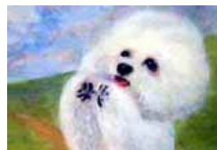
"Go Chipper, Go!"