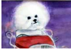
"Showing In Style"