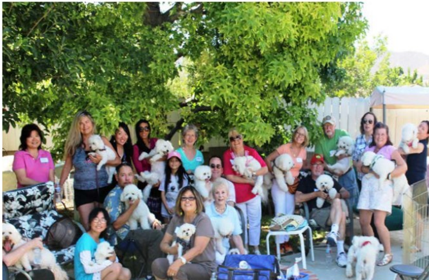
Bichon Frise Club Bash, August 13 in Oak Park