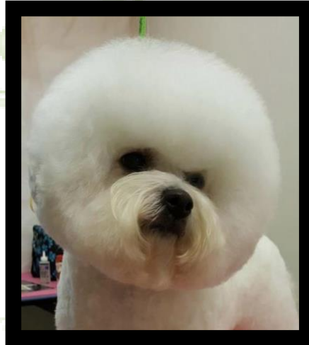
CH Whitebred and Aphrodite Goddess of Love ROM "Athena"