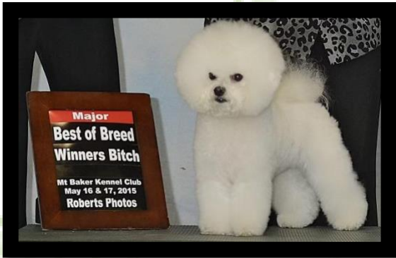
CH Absolutely Agape Fast and Flashy ROM "FloJo"

Congratulations to the following dogs that have been awarded ROM/ROMX titles.