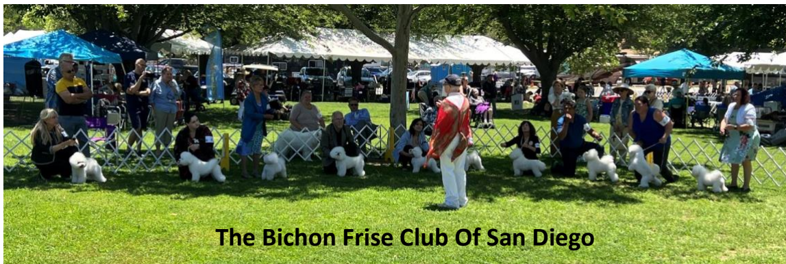
The Bichon Frise Club Of San Diego